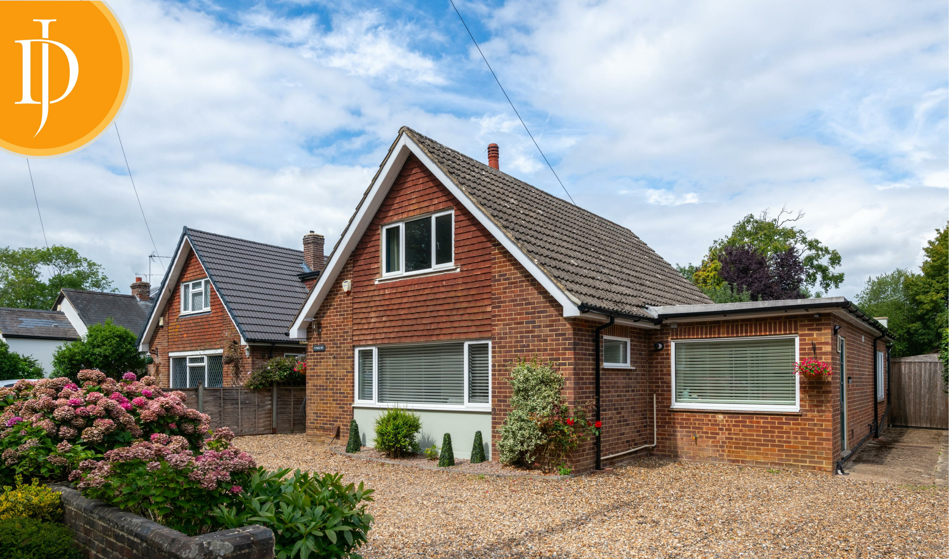
Tenbury Mill Lane, Hookwood, RH6 0HX Asking Price £750,000